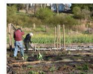
grows fresh food for the homeless