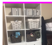
creates storage space for homeless shelters