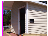
provides a pet shelter for victims of domestic violence